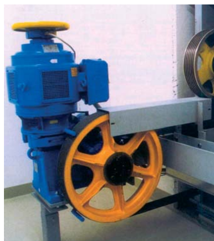
CG26 lift drive

FLENDER TÜBINGEN has manufactured drives for cable lifts since the mid-90s. There is the single-stage CAVEX® CG45 worm gear unit for useful loads of up to 630 kg, and the CG26 series for useful loads of up to 2.500 kg with a 1:1 cable suspension ratio. This helical worm gear units combine the classical advantages of worm gear units - quiet running, high transmission ratio in a single stage, angled design - with the advantages of helical gear units - high efficiency and compactness for high performance.